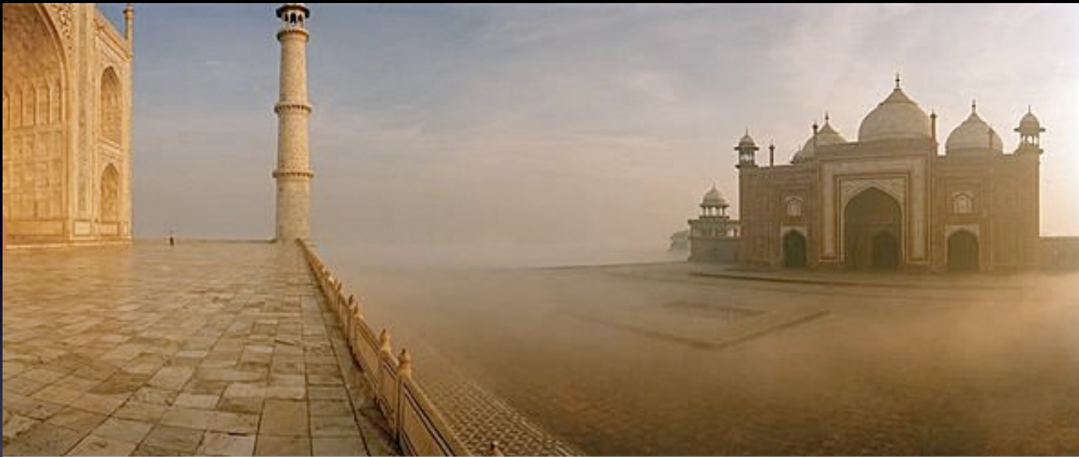
Dawn at Taj Mahal